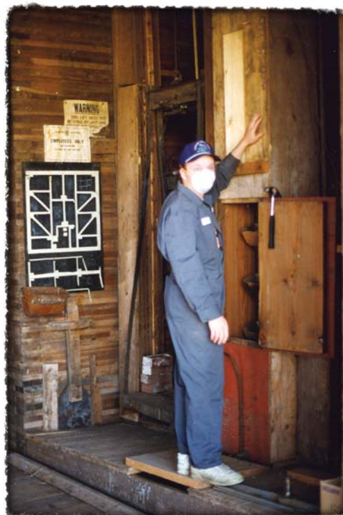
Restoration work started in the Meeting Creek AB Pacific elevator, 1999.