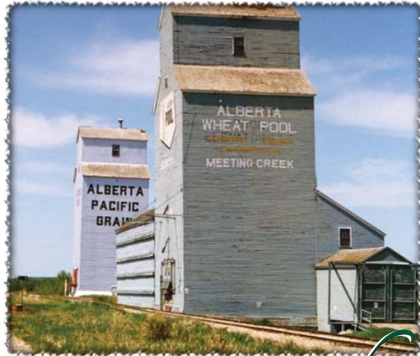
Meeting Creek elevators before restoration work started, 1987.

The Canadian Northern Society, in its 20th anniversary year also recognizes three other grain elevator preservation projects in central Alberta. Through the dedication and efforts of the Big Valley Historical Society, Big Valley's last Alberta Wheat Pool grain elevator, built in the early 1960s, was preserved in 1998. In