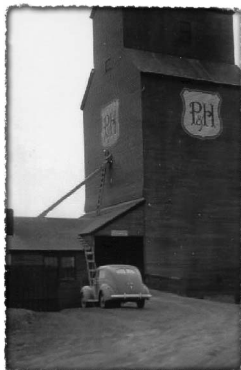
Stettler P&H elevator, c. 1940s.